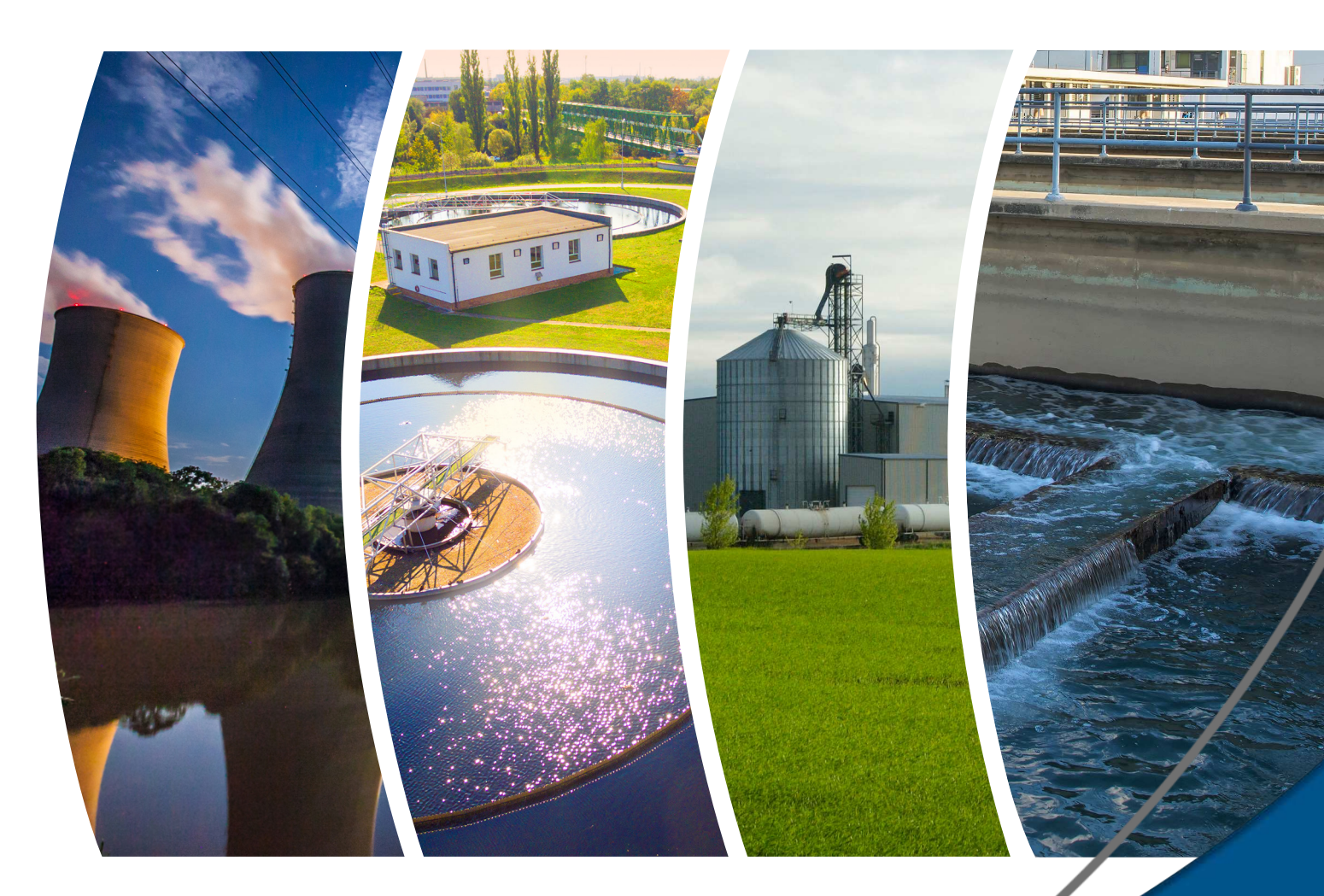
We Bring Clarity To Water Treatment