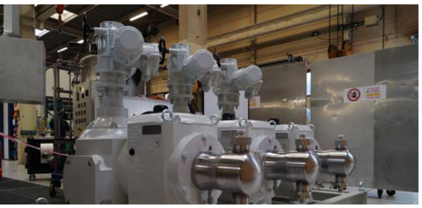
Milton Roy's Primeroyal R triplex metering pumps that were specially-configured to the meet the project requirements.

etering pumps are relatively small components on a production platform but they perform a critical role. This article takes a look at how metering pumps were customized to effectively deliver chemicals to record depths, for deep offshore production in Indonesia.