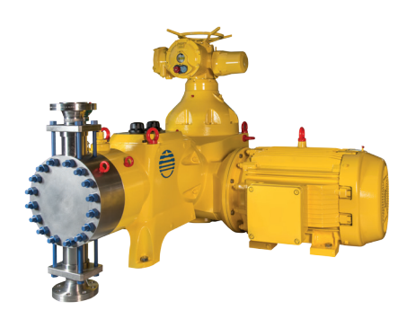
The Primeroyal X with metallic liquid end and PTFE (Teflon®) double diaphragm, horizontal motor configuration, and actuator with integrated electronics.