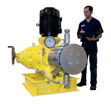
The Primeroyal X with metallic liquid end and metallic double diaphragm, vertical motor configuration, and manual stroke adjustment.

If you need a single source solution for all your pump requirements, it's Milton Roy.