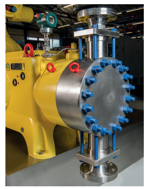
The 20K PSIG Primeroyal X delivers greater flow and higher pressure ranges.

Milton Roy's new Primeroyal X pump extends capabilities in even the most challenging environments at 20K PSIG.